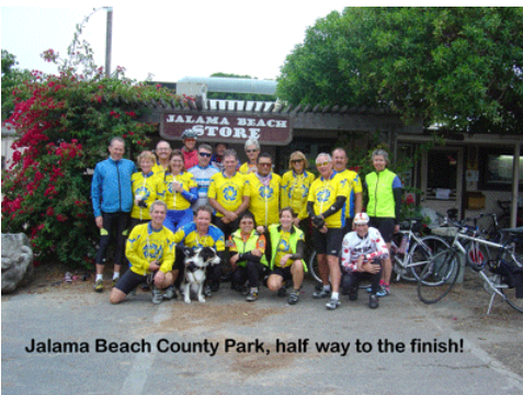
Jalama Beach County Park, half way to the finish!