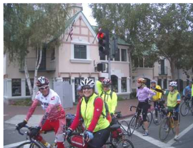
The "Lure Tour" hits all the high points, including downtown Solvang

...continued from page 1... All activities begin at the Flying Flags Campground at 688-3716 in Buellton. The starting place is directly off the 101 Freeway at Santa Rosa Road exit. If you plan to RV camp, ask for a site in the 332-355 area. Tenting? No problem, just pick a site on the large grass tent area near 8th Street within the campground. The campground has full hookups, hot showers with a pool and spa! Camping not for you? Well, the Days Inn Windmill at (805)688-8448 backs up right to the campground for easy access!