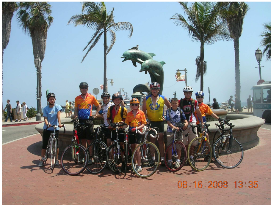
The Scouts enjoy a Cool Breeze respite at the Stearns Wharf fountain

On Saturday, August 16, 2008, I went on the 100-mile Cool Breeze Century bike ride. We left at about 5:50 in the morning and I got back around 4:20 in the afternoon. It took about 11 hours and 30 minutes, but it was extremely fun. We stopped at four rest stops: Rincon Beach twice,