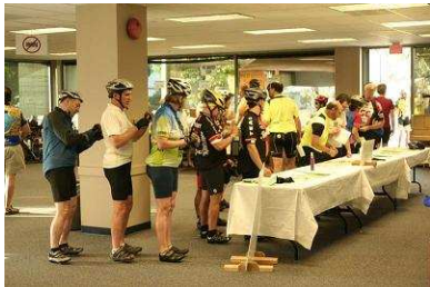
The chow line went on and on...

scheduled to end at 5:00 p.m., but we were serving meals until almost 7 p.m.!